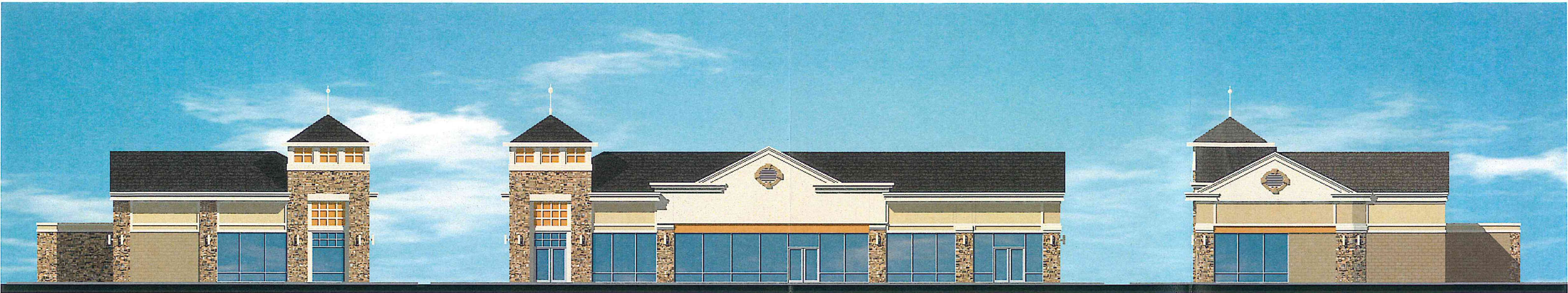
EAST ELEVATION - 3