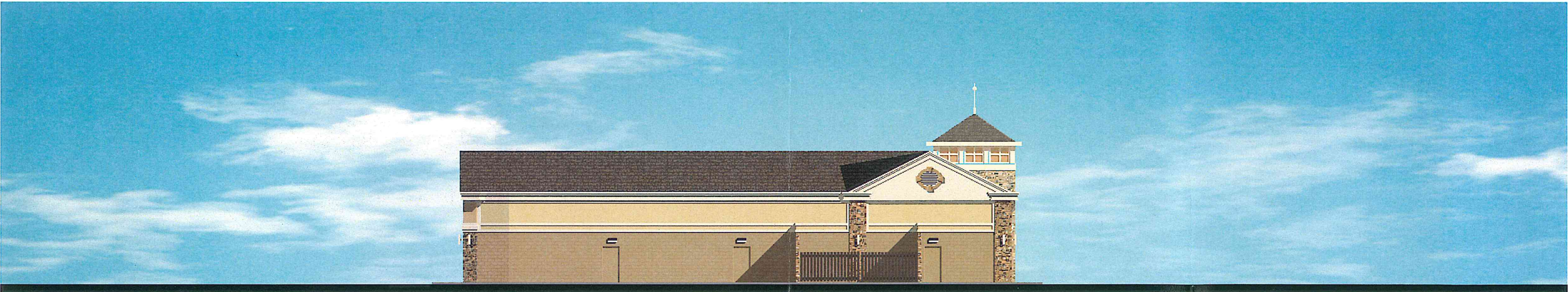
SOUTH ELEVATION - 3