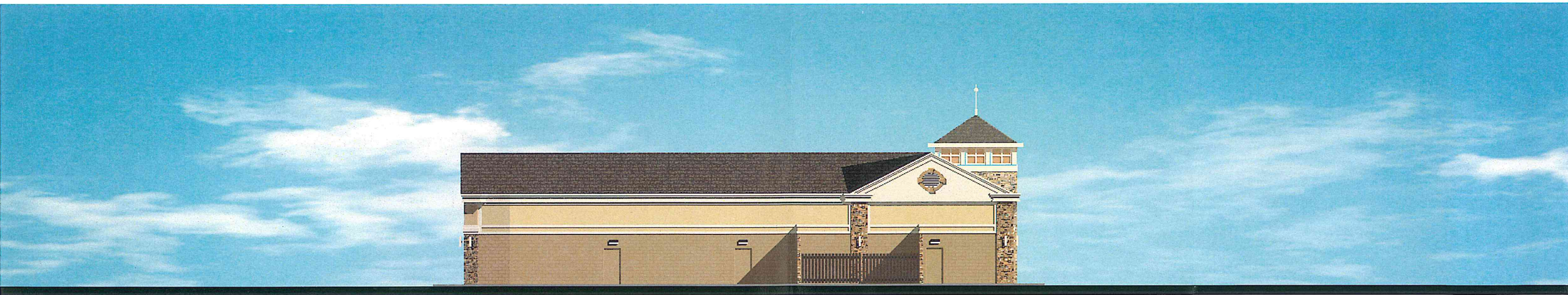
SOUTH ELEVATION - 3