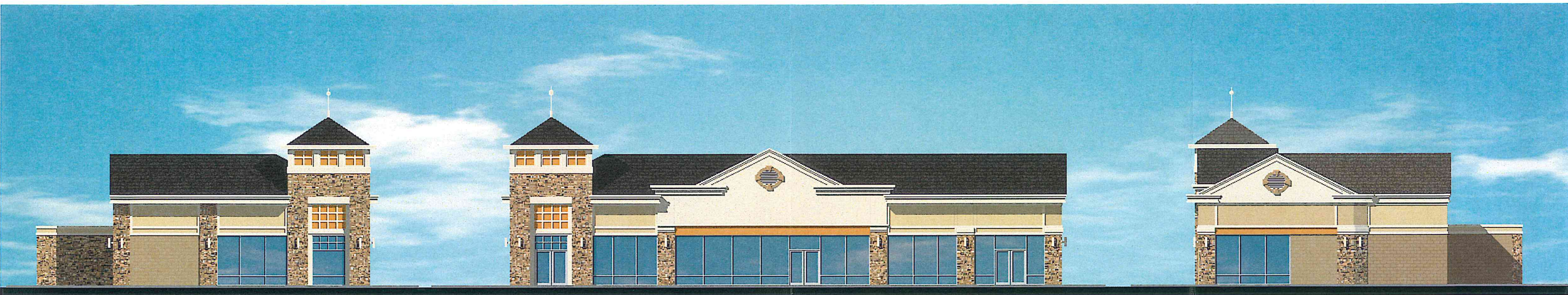
EAST ELEVATION -3