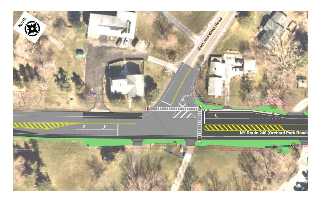
NY Route 240 at East and West Road

The project will enhance safety and improve mobility on NY Route 240 at the intersections with Fisher Road and East and West Road. It will provide wider and clearly marked turn lanes on NY Route 240 at East and West Road. It will also reduce delays at the intersection of NY Route 240 and Fisher Road, particularly for traffic exiting Fisher Road.