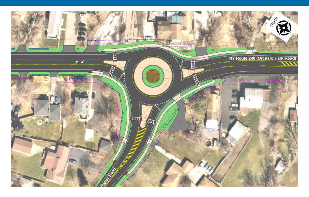
NY Route 240 at Fisher Road